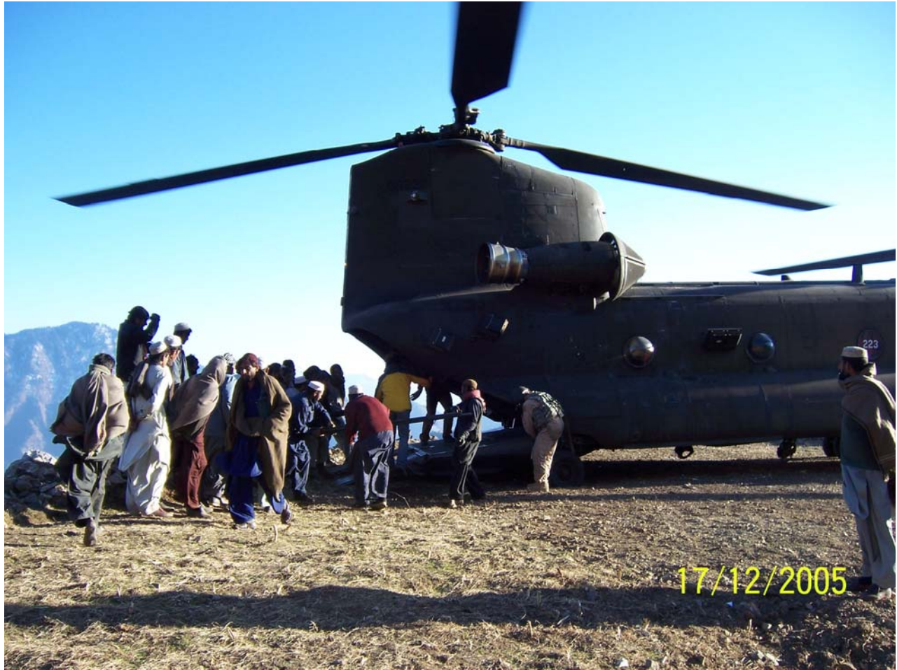
Figure 3: Off-loading supplies at a remote village in Pakistan

would seem to be the natural #1 priority, but if a forklift wasn't available to off-load the cargo from an aircraft, delivery would be slowed considerably. This is a classic project management problem that might be solved with techniques such as the critical path method or PERT charts, but in the heat of the moment there just isn't time to apply such a meticulous methodology. Top leaders for the effort must provide timely direction on appropriate priorities. They are likely to be the only ones with enough knowledge to provide this critical "big picture" guidance.