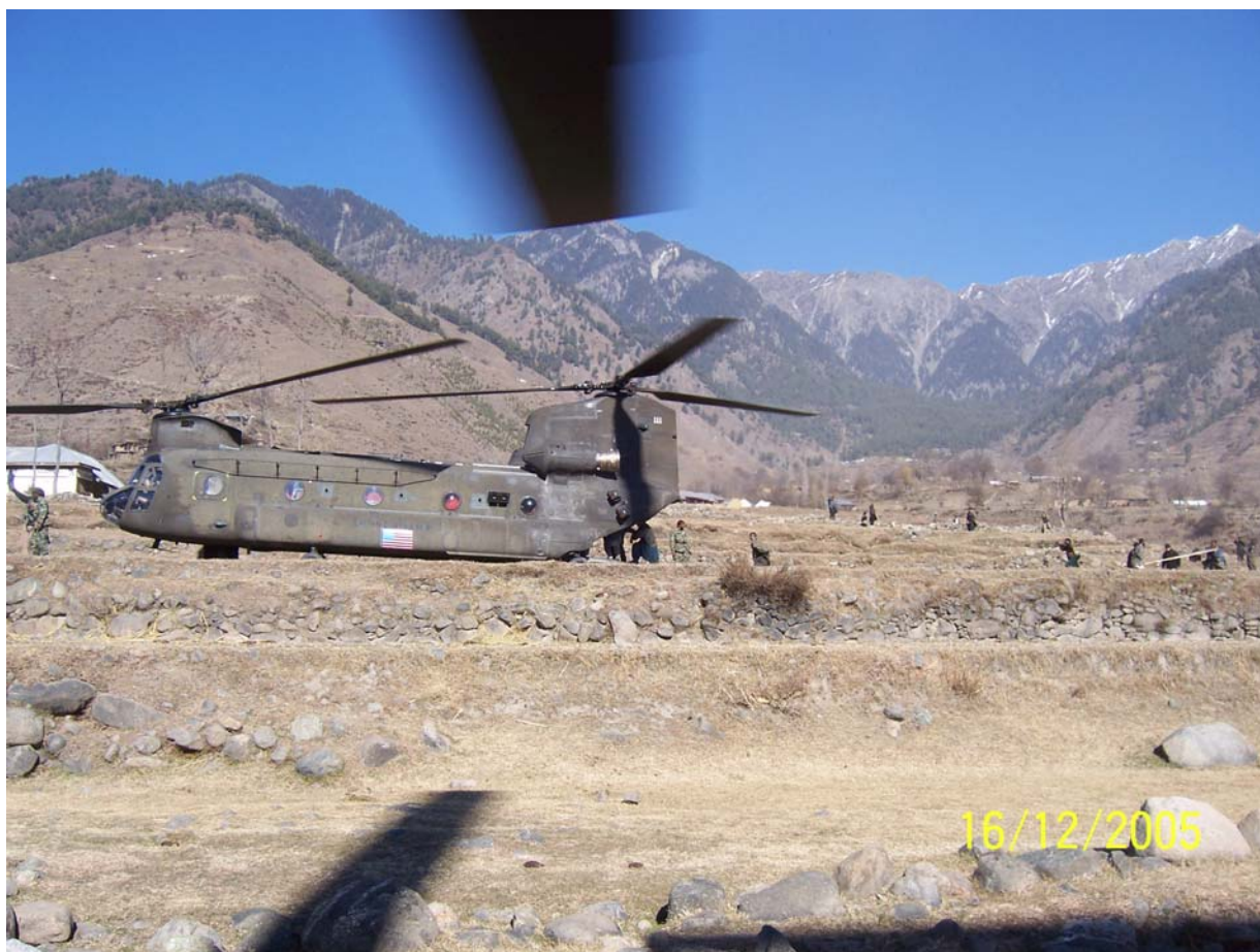
Figure 2: A U.S. Army Chinook helicopter delivering supplies in Pakistan

of the academic literature, ephemeral organizations should be created in such a way that the participants can create a common cognitive map of the structure quickly (Alexander, 2004). Making sense of the complex and rapidly changing environment of a disaster situation is one of the most difficult tasks for leaders and workers alike (Weick, 1988, 1990, 1993). Weick (1993, p. 635) points out that “organizations [are] important because they can provide meaning and order in the face of environments that impose ill-defined, contradictory demands.” The COSC demonstrated that a new structure that is created with a common cognitive map enables effective sense-making for those in the organization.